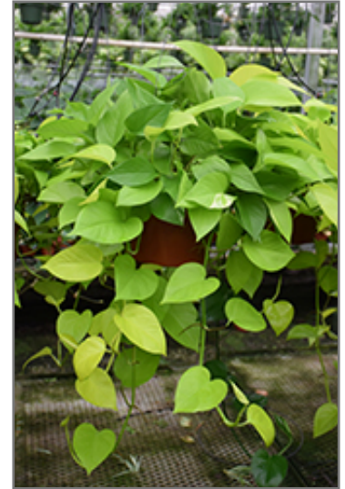
Neon Pothos in full

When grown indoors, Neon Pothos can be expected to grow to be about 5 feet tall at maturity, with a spread of 24 inches. It grows at a fast rate, and under ideal conditions can be expected to live for approximately 10 years. This houseplant performs well in both bright or indirect sunlight and strong artificial light, and can therefore be situated in almost any well-lit room or location. It does best in average to evenly moist soil, but will not tolerate standing water. The surface of the soil shouldn't be allowed to dry out completely, and so you should expect to water this plant once and possibly even twice each week. Be aware that your particular watering schedule may vary depending on its location in the room, the pot size, plant size and other conditions; if in doubt, ask one of our experts in the store for advice. It is not particular as to soil type or pH; an average potting soil should work just fine. Be warned that parts of this plant are known to be toxic to humans and animals, so special care should be exercised if growing it around children and pets.