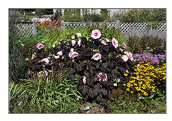
Starry Starry Night Hibiscus in bloom