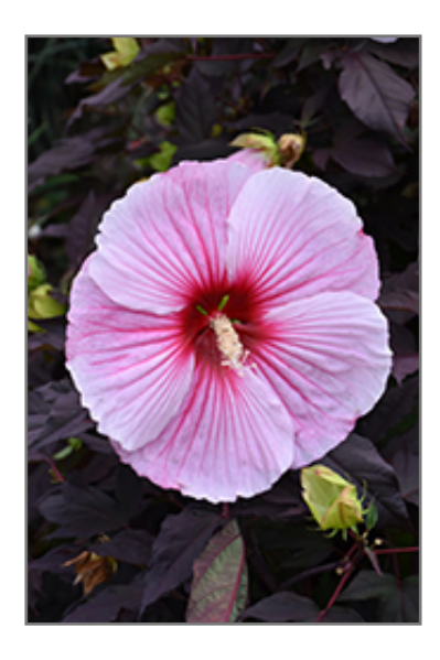
Starry Starry Night Hibiscus flowers

This plant will require occasional maintenance and upkeep, and should be cut back in late fall in preparation for winter. It is a good choice for attracting butterflies and hummingbirds to your yard, but is not particularly attractive to deer who tend to leave it alone in favor of tastier treats. Gardeners should be aware of the following characteristic(s) that may warrant special consideration;