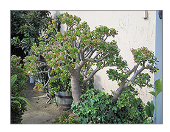
Jade Plant

This is a relatively low maintenance shrub, and can be pruned at anytime. It is a good choice for attracting bees and butterflies to your yard, but is not particularly attractive to deer who tend to leave it alone in favor of tastier treats. It has no significant negative characteristics.