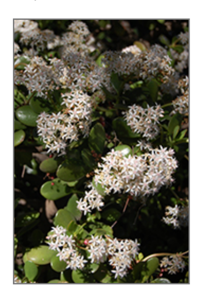
Jade Plant flowers