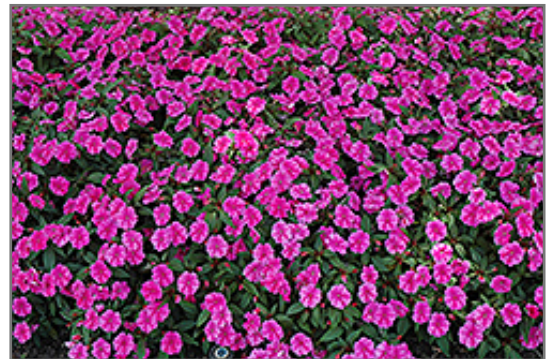
Bounce Pink Flame Impatiens in bloom