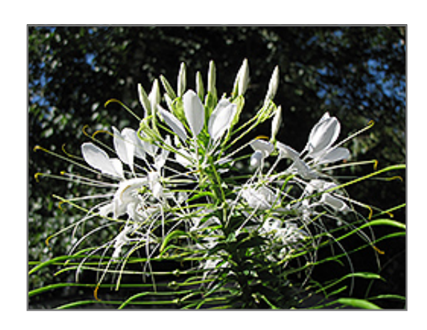
Helen Campbell Spiderflower flowers

This plant will require occasional maintenance and upkeep, and should be cut back in late fall in preparation for winter. It is a good choice for attracting butterflies to your yard, but is not particularly attractive to deer who tend to leave it alone in favor of tastier treats. It has no significant negative characteristics.