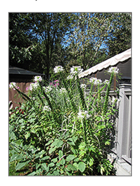
Helen Campbell Spiderflower in bloom

Helen Campbell Spiderflower is recommended for the following landscape applications;