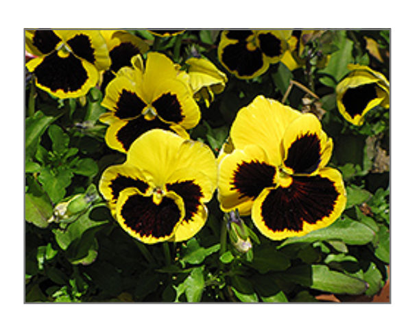
Delta Yellow With Blotch Pansy flowers

This variety produces spectacular blooms that are bright yellow with dramatic, nearly black blotches; flowers early and persistently all season, even in low light; well branched with a free flowing habit