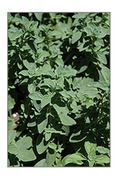
Italian Oregano foliage

This variety is noted for its lovely, mild flavour and aroma; does well in sandy loam, good heat and drought tolerance; a perfect addition to the herb garden, and is also great for containers