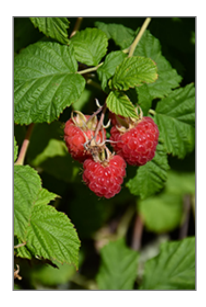
Raspberry Shortcake Raspberry fruit

Raspberry Shortcake Raspberry has rich green deciduous foliage on a plant with an upright spreading habit of growth. The textured oval compound leaves do not develop any appreciable fall colour. It features an abundance of magnificent red berries in mid summer.