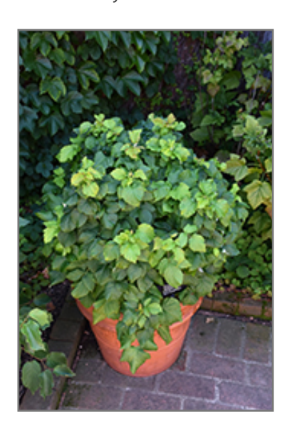
Raspberry Shortcake Raspberry