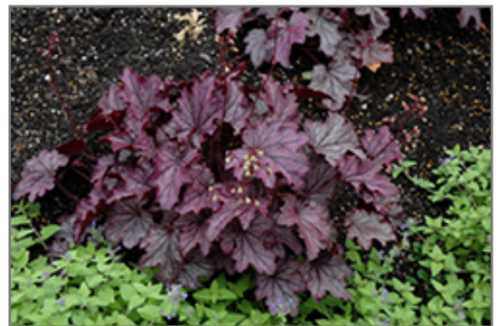
Spellbound Coral Bells