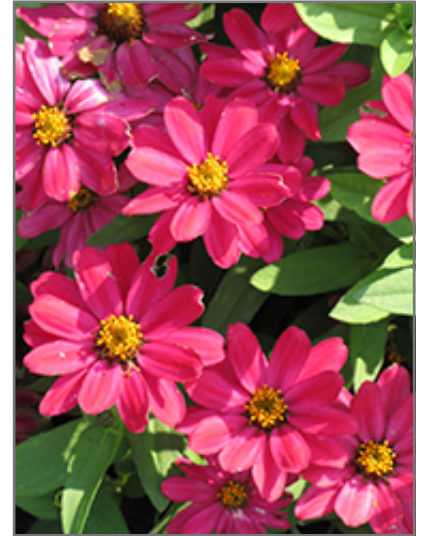
Profusion Cherry Zinnia flowers