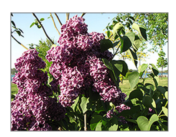
Monge Lilac flowers

A ravishing spring blooming lilac featuring intensely fragrant bright purple in upright panicles; upright, multi-stemmed habit, very hardy, tends to sucker, ideal for screening; full sun and well-drained soil, allow room for air movement