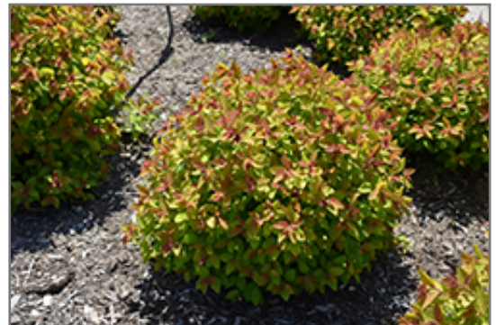
Double Play Big Bang Spirea