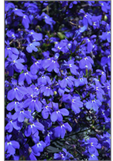
Techno Blue Lobelia flowers

Techno Blue Lobelia is recommended for the following landscape applications;