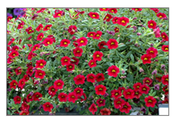
MiniFamous Compact Dark Red Calibrachoa flowers

MiniFamous Compact Dark Red Calibrachoa is a dense herbaceous annual with a trailing habit of growth, eventually spilling over the edges of hanging baskets and containers. Its medium texture blends into the garden, but can always be balanced by a couple of finer or coarser plants for an effective composition.