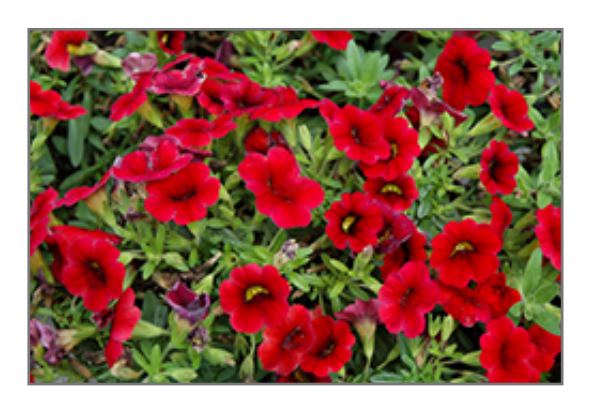
MiniFamous Compact Dark Red Calibrachoa flowers

This plant will require occasional maintenance and upkeep. Trim off the flower heads after they fade and die to encourage more blooms late into the season. It is a good choice for attracting bees and hummingbirds to your yard, but is not particularly attractive to deer who tend to leave it alone in favor of tastier treats. It has no significant negative characteristics.