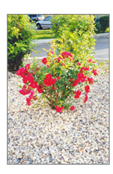
Alexander Mackenzie Rose in bloom

Alexander Mackenzie Rose is recommended for the following landscape applications;