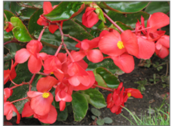
Dragon Wing Red Begonia flowers

Dragon Wing Red Begonia is an herbaceous annual with a trailing habit of growth, eventually spilling over the edges of hanging baskets and containers. Its medium texture blends into the garden, but can always be balanced by a couple of finer or coarser plants for an effective composition.