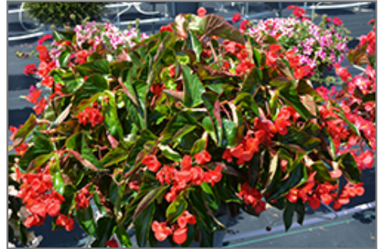
Dragon Wing Red Begonia in bloom

Dragon Wing Red Begonia is a fine choice for the garden, but it is also a good selection for planting in outdoor containers and hanging baskets. Because of its trailing habit of growth, it is ideally suited for use as a 'spiller' in the 'spiller-thriller-filler' container combination; plant it near the edges where it can spill gracefully over the pot. Note that when growing plants in outdoor containers and baskets, they may require more frequent waterings than they would in the yard or garden.