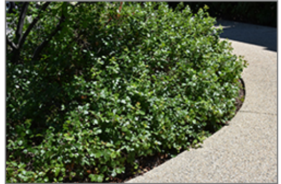
Gro-Low Fragrant Sumac

Gro-Low Fragrant Sumac is recommended for the following landscape applications;