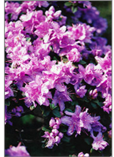
Ramapo Rhododendron flowers