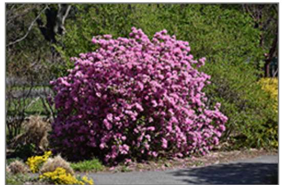
P.J.M. Elite Rhododendron in bloom