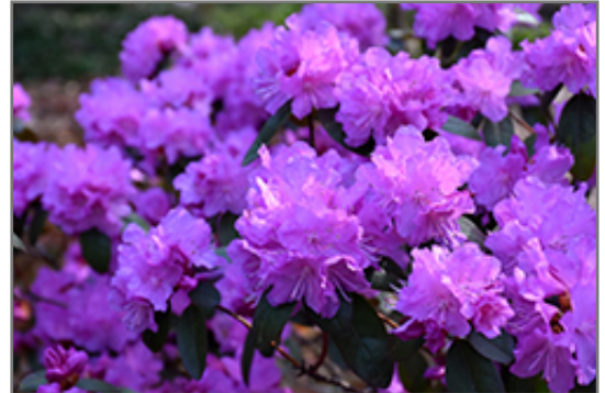
P.J.M. Elite Rhododendron flowers

P.J.M. Elite Rhododendron is recommended for the following landscape applications;