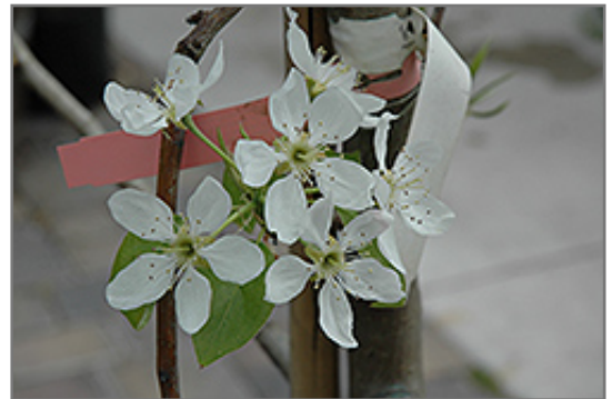
Bosc Pear flowers