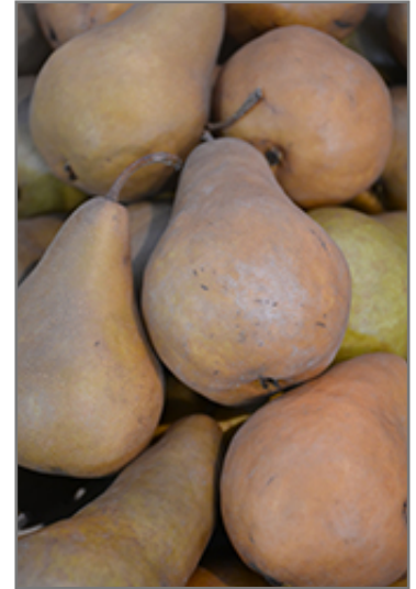
Bosc Pear fruit