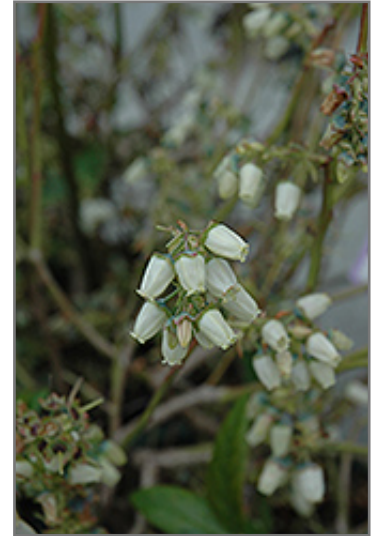
Chandler Blueberry flowers

This plant is not reliably hardy in our region, and certain restrictions may apply; contact the store for more information.