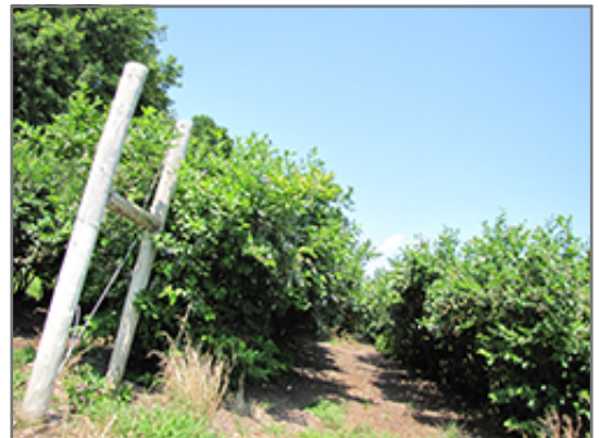
Chandler Blueberry fruit