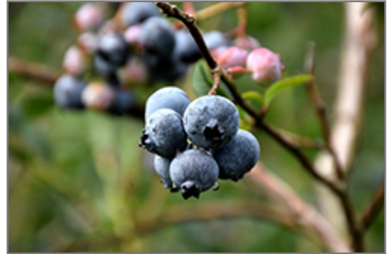
Chandler Blueberry fruit

Chandler Blueberry features dainty clusters of white bell-shaped flowers hanging below the branches in mid spring. It has bluish-green deciduous foliage. The oval leaves turn an outstanding red in the fall. It features an abundance of magnificent blue berries from mid to late summer. The smooth tan bark adds an interesting dimension to the landscape.