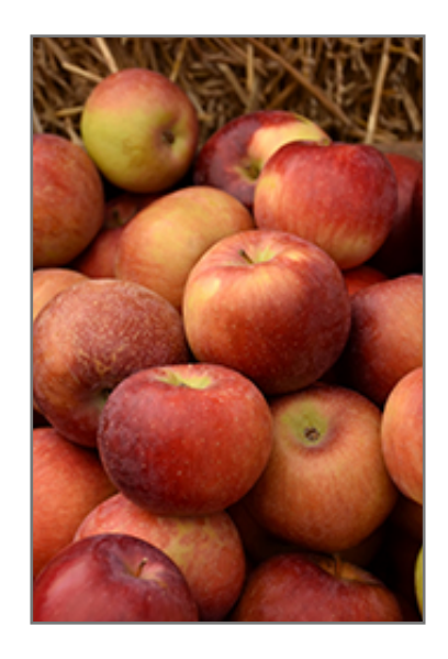
Empire Apple fruit

Empire Apple features showy clusters of lightly-scented white flowers with shell pink overtones along the branches in mid spring, which emerge from distinctive pink flower buds. It has forest green deciduous foliage. The pointy leaves turn yellow in fall. The fruits are showy crimson apples with a light green blush, which are carried in abundance from early to mid fall. The fruit can be messy if allowed to drop on the lawn or walkways, and may require occasional clean-up.