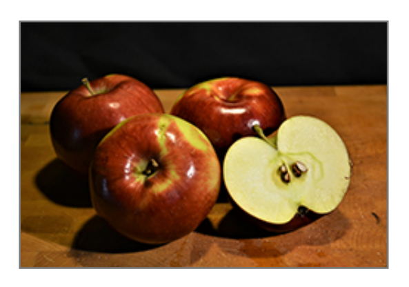
Empire Apple fruit and flesh